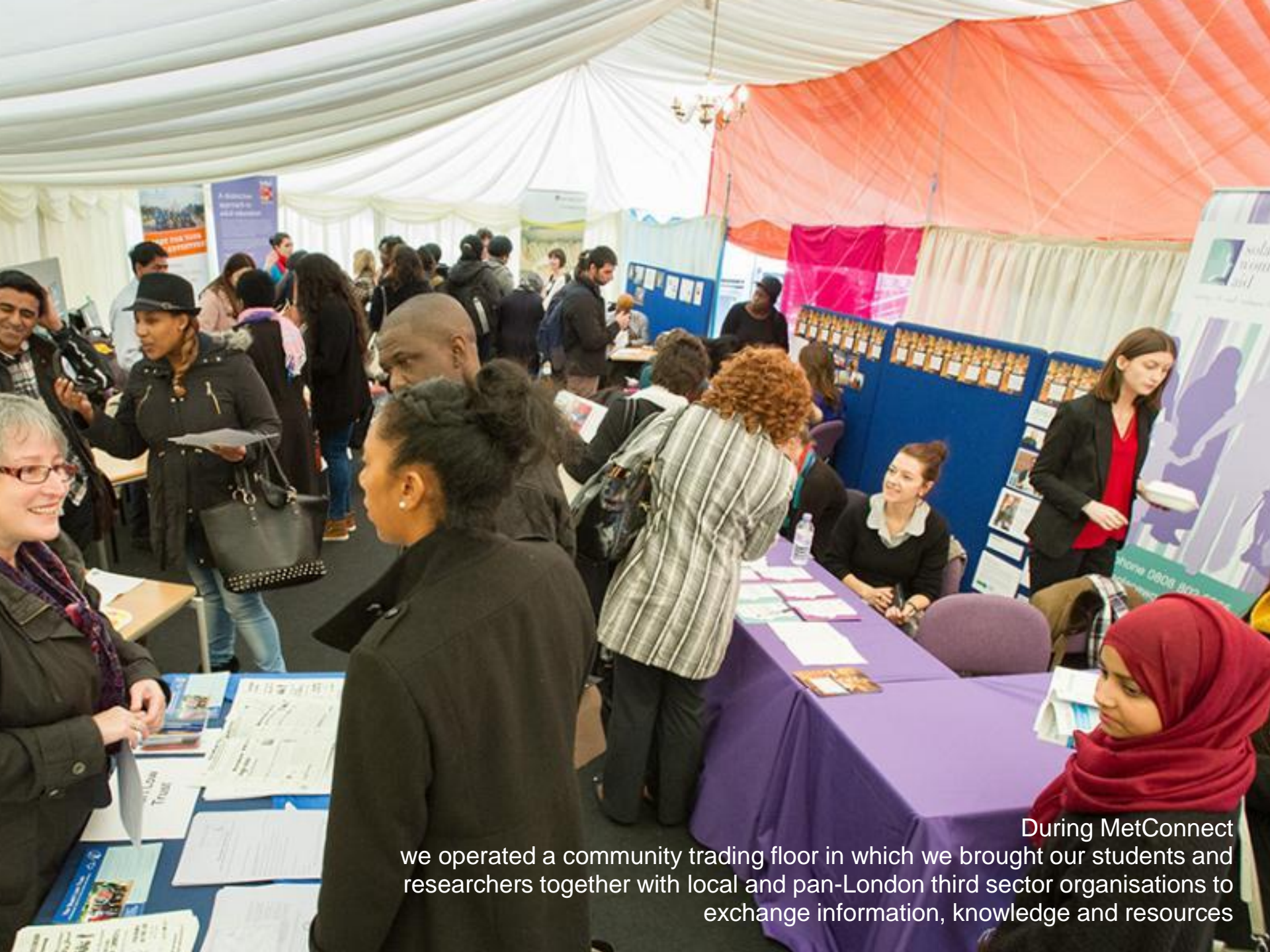
During MetConnect we operated a community trading floor in which we brought our students and researchers together with local and pan-London third sector organisations to exchange information, knowledge and resources